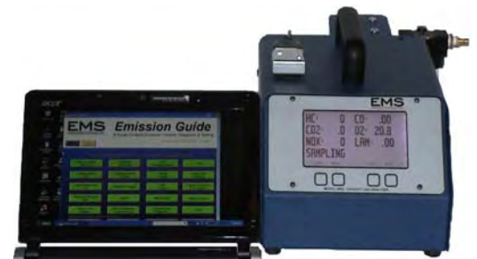
Emissions Guide Software FREE w/Analyzer