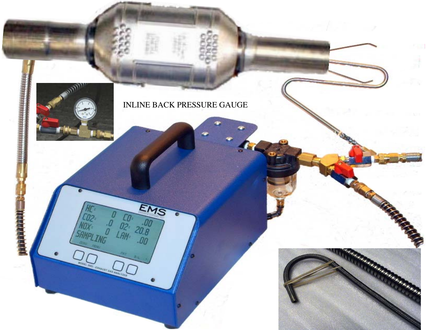
INLINE BACK PRESSURE GAUGE